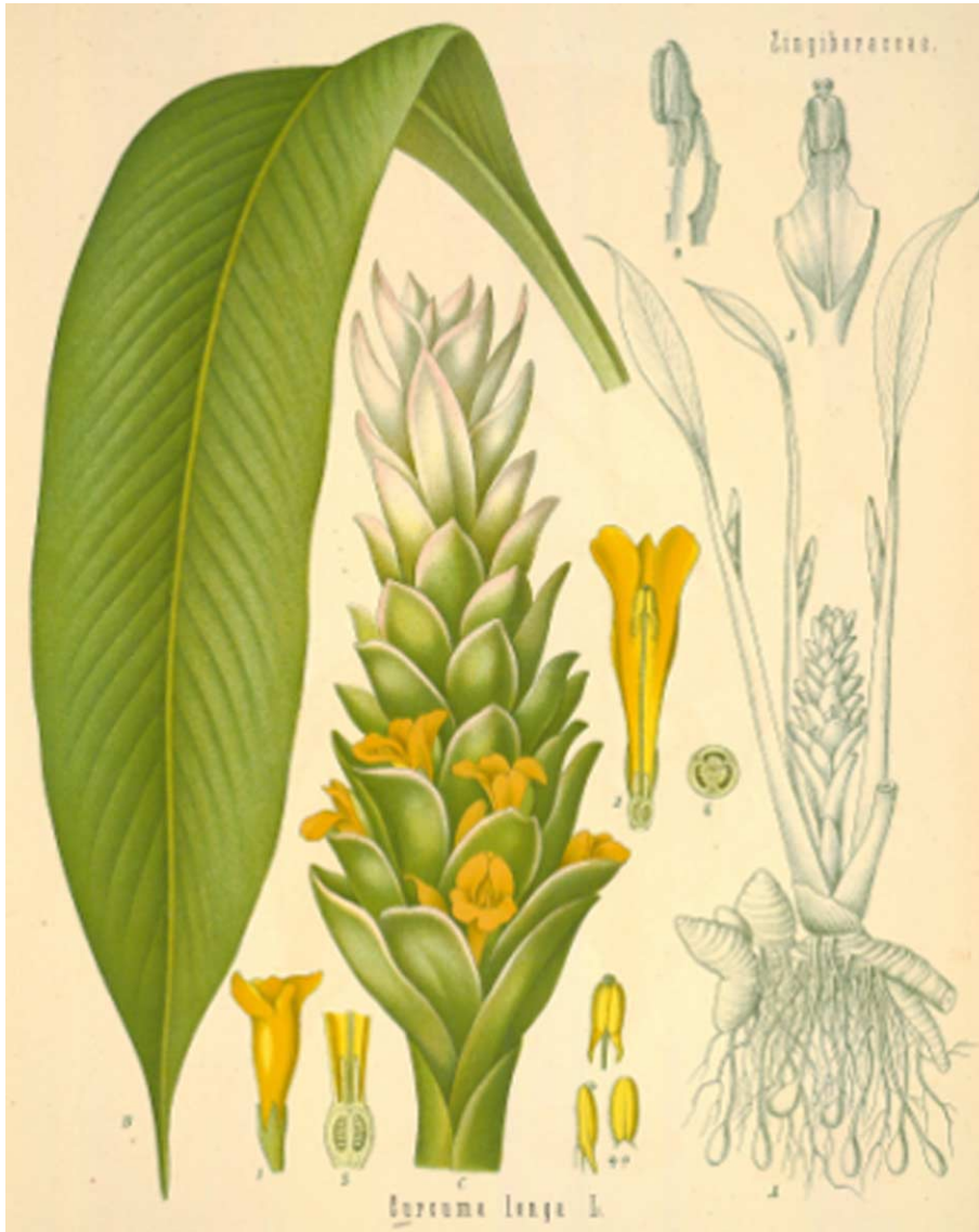
Fig. 3. Curcuma longa L..

anti-oxidative, anti-inflammatory and anti-septic properties [5] and is widely used in Indian medicine and culinary traditions. However, recent data give additional evidence that curcumin could also serve in cancer therapy as a drug or as an adjuvant to traditional chemotherapy. This review will focus on both chemopreventive and chemotherapeutic effects of curcumin.